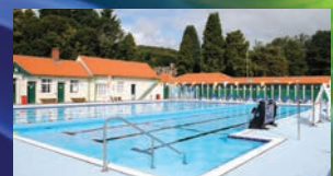
Swimming & Spa Pools