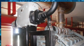
Active Fire Protection Systems

replacement parts service and a network of stockists worldwide. Already established as the leading brand for marine industry cooling, Bowman heat transfer solutions can also be found in applications as diverse as;