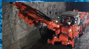
Mining Equipment & Machinery