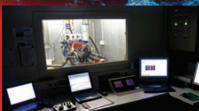
Automotive Engine Testing